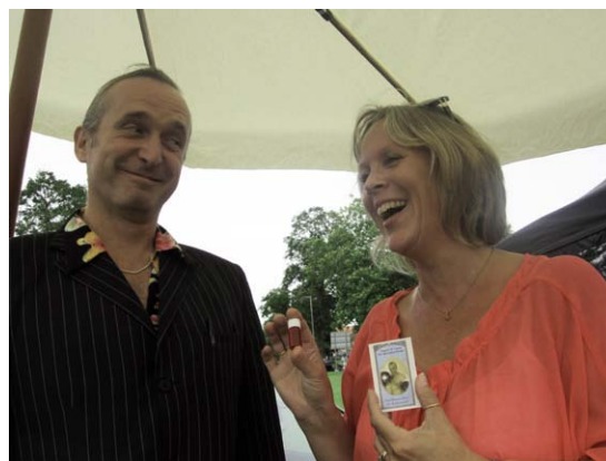
Some of the many satisfied miracle seekers at Devizez International Street Arts Festival 2012

Personalised treatments are for anywhere between 1 and 4 people at a time. Individual, couples or family treatments welcome.